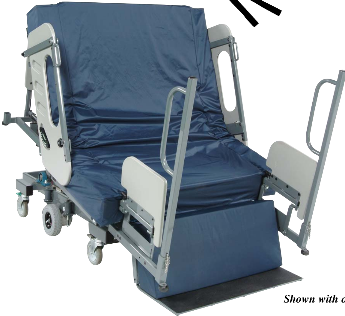
Shown with options

Enter/Exit at Foot of Bed ~ Center Section Seat Lift 1,000 lb. Capacity